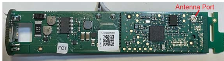
PCB Components Side 01