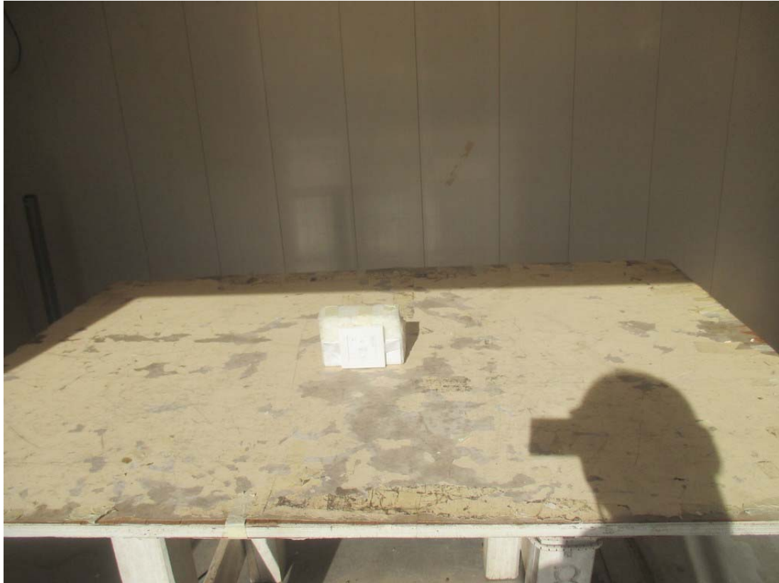
Standard Orientation (Z)