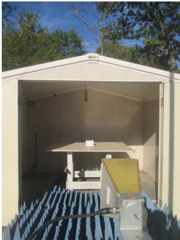
Figure 3.1 Radiated Test Setup