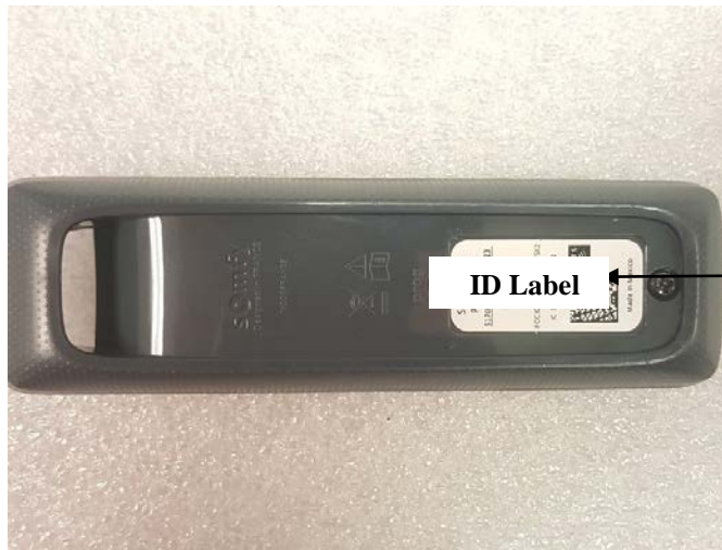
Figure 2.2 ID Label Location