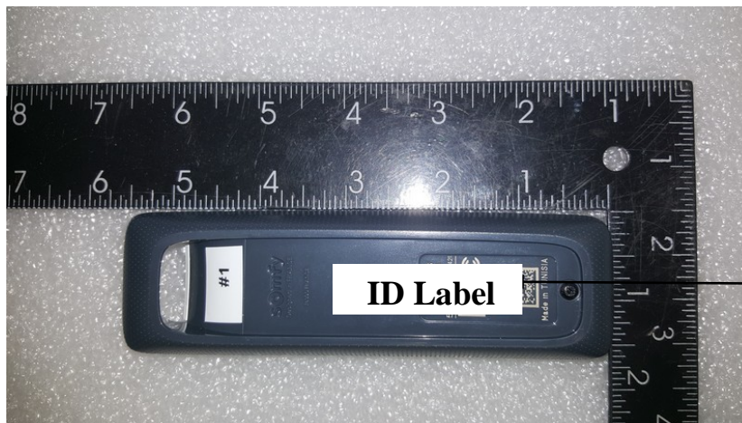
Figure 2.2 ID Label Location