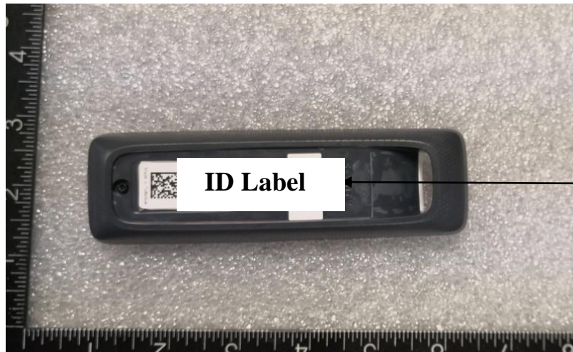
Figure 2.2 ID Label Location