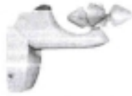
24V SOLIRIS RTS SENSOR KIT CAT NO. 6301051 (includes transformer, not shown)