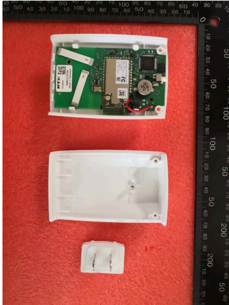
Figure 7.7 Inside View AC adapter removed