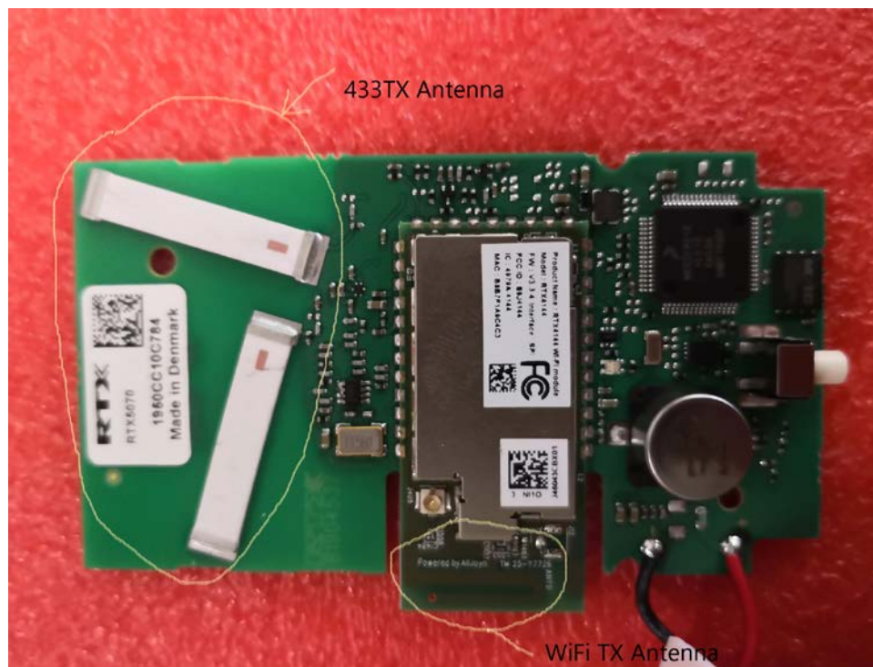
Figure 7.9 RF Board Component Side