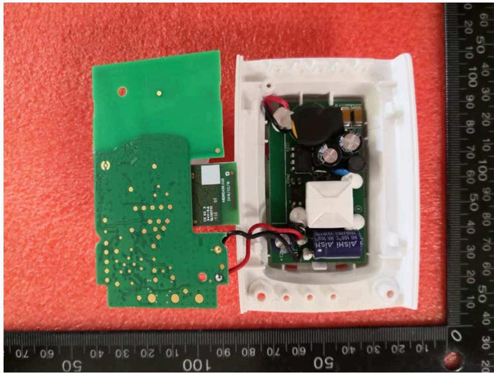
Figure 7.8 Power Supply Board Component Side