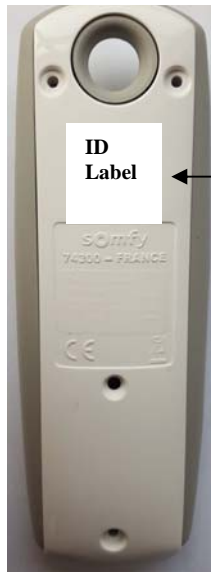
Figure 2.2 FCC ID Label Location