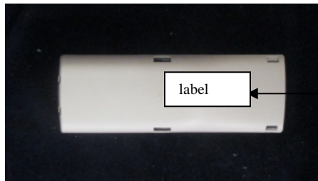
Figure 2.2 Location of the Label