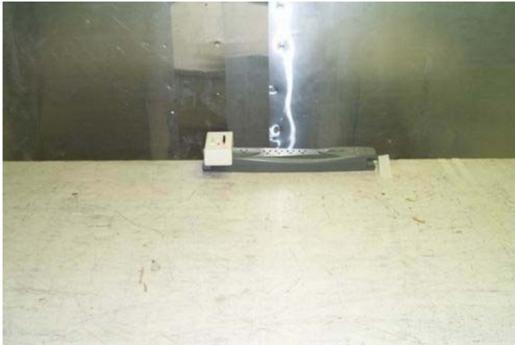
Figure 3.4 Conducted Setup- Front