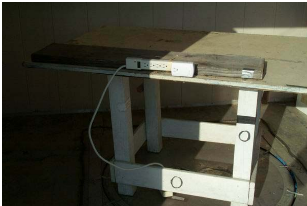
Figure 3.2 Radiated Test Setup, position 2-Y