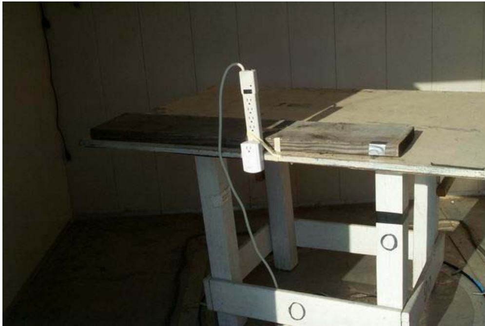
Figure 3.1 Radiated Test Setup, position 1-X