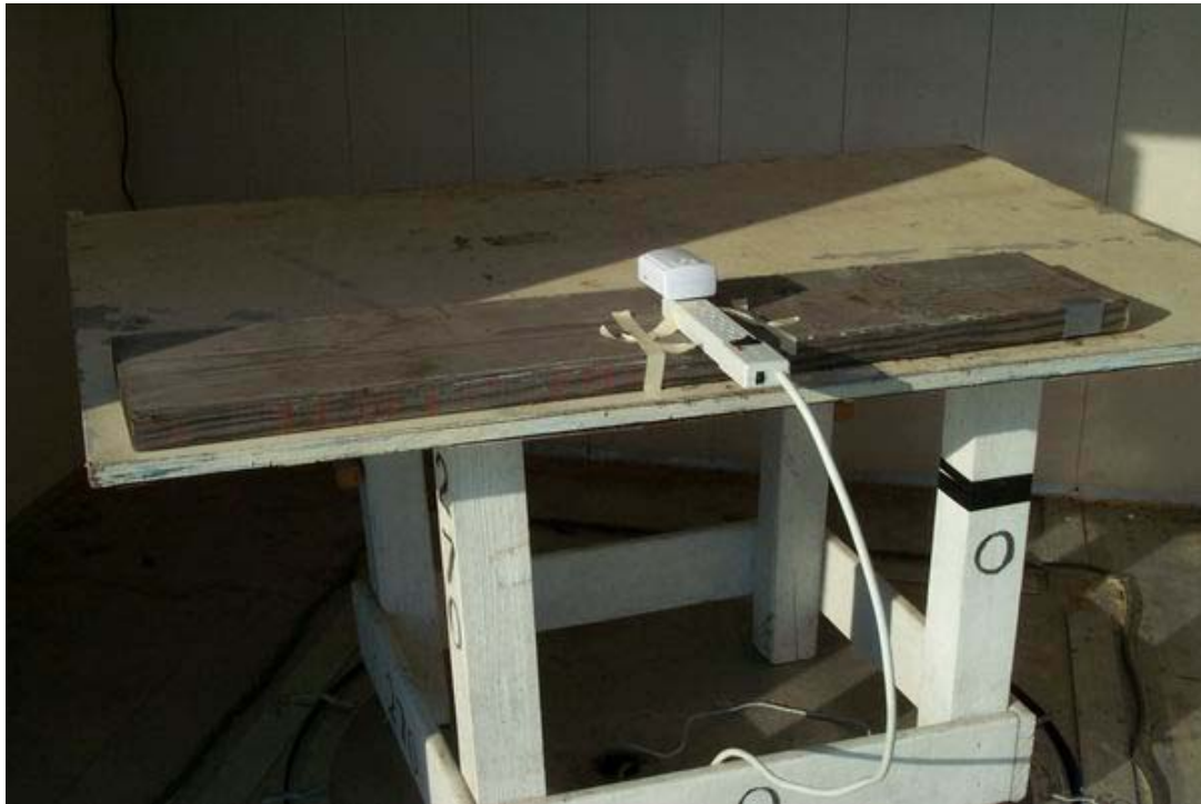
Figure 3.3 Radiated Test Setup, position 3-Z