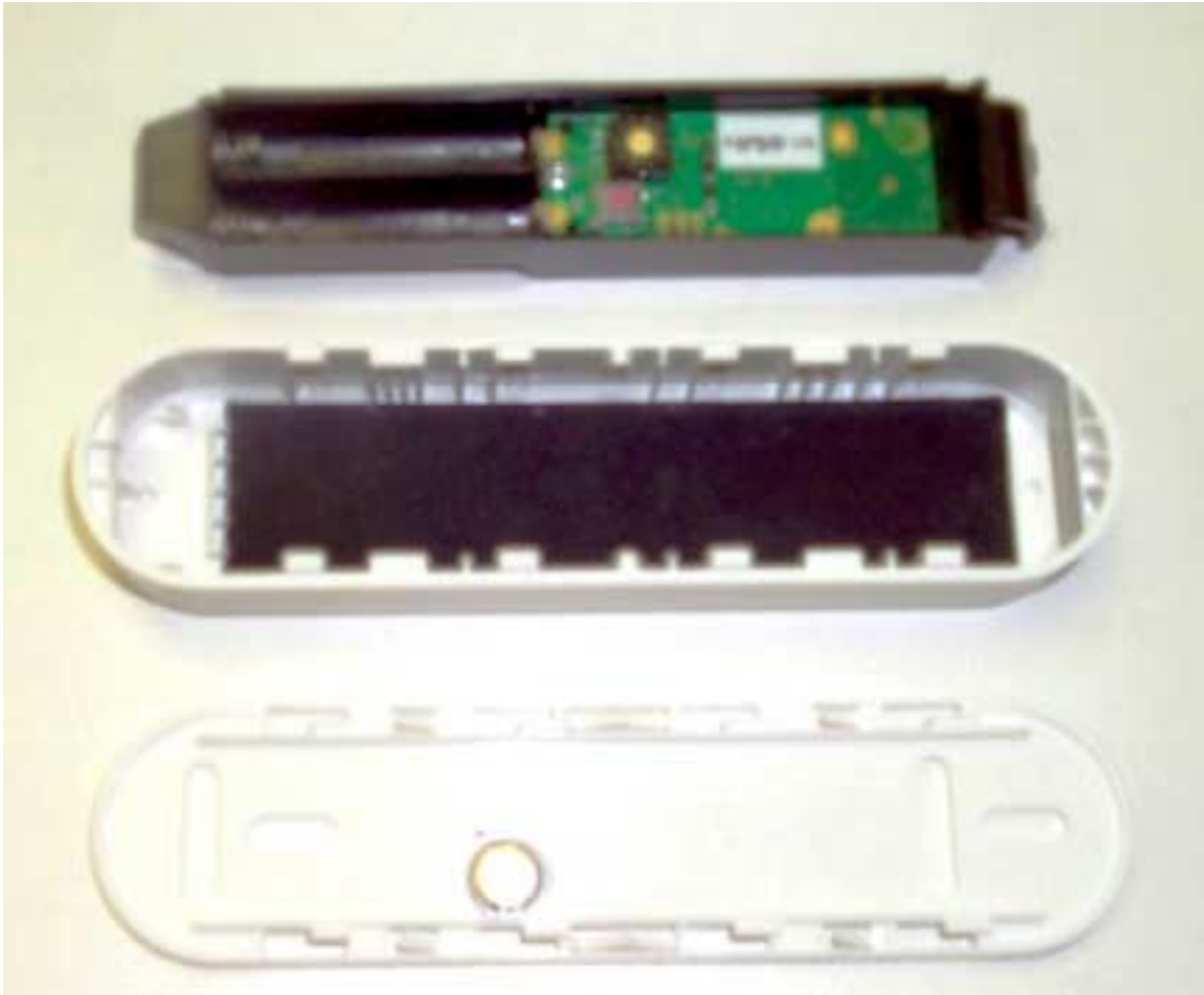
Figure 7.3 Open View