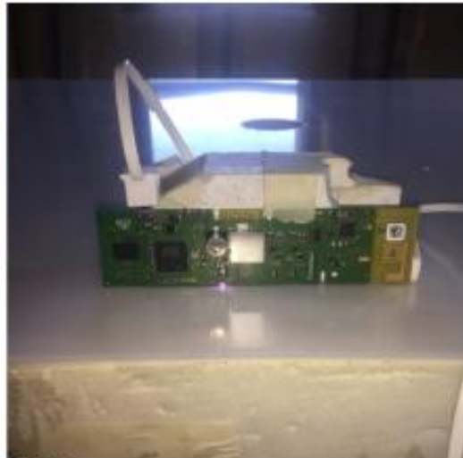
Axis Z on OATS

Photograph for Unwanted Emission in restricted frequency bands