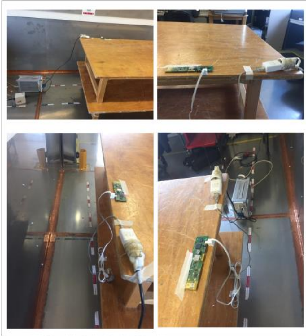
Photograph for AC Power Line Conducted Emissions (Front view)