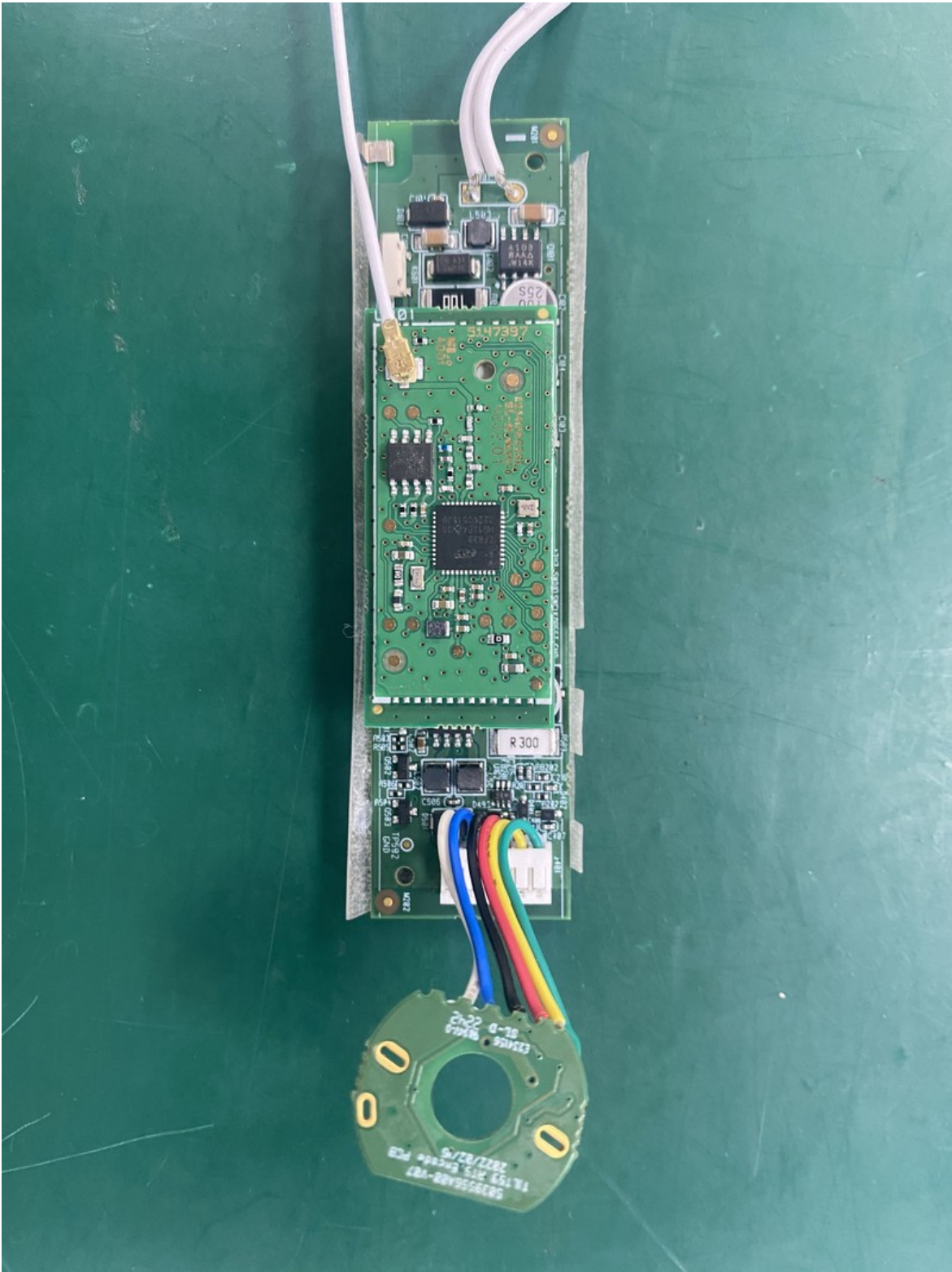
TO50 ZB Additional Internal Photos