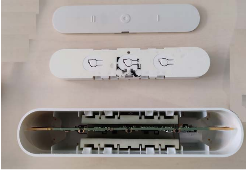
EUT Inside View