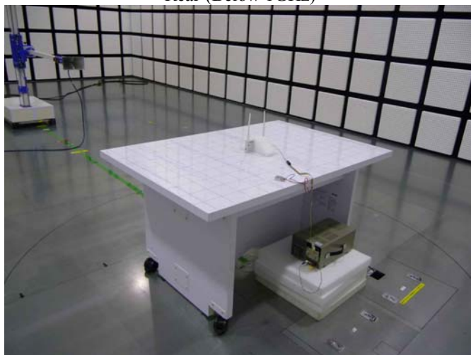
Rear (Above 1GHz)