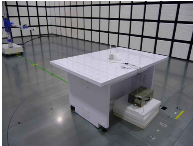
Rear (Below 1GHz)