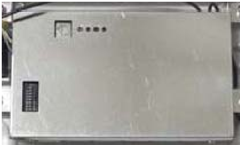
Side A with Shield