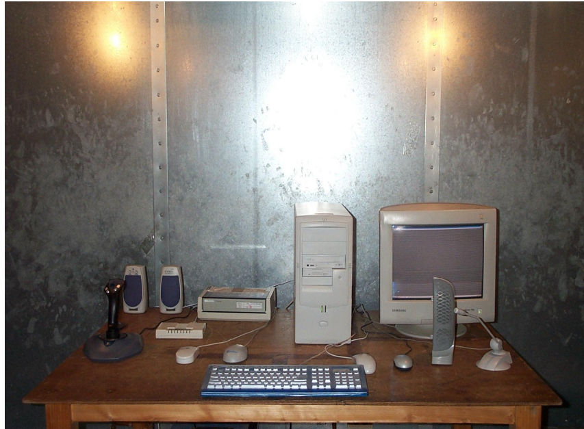
Photograph 1: Setup for Conducted Emissions