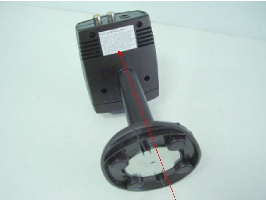
FCC ID Label