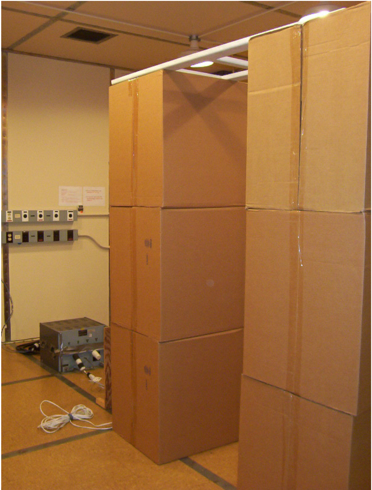
Photo 1 – Conducted Emissions Setup – Antenna On Empty Boxes and Controller on Floor