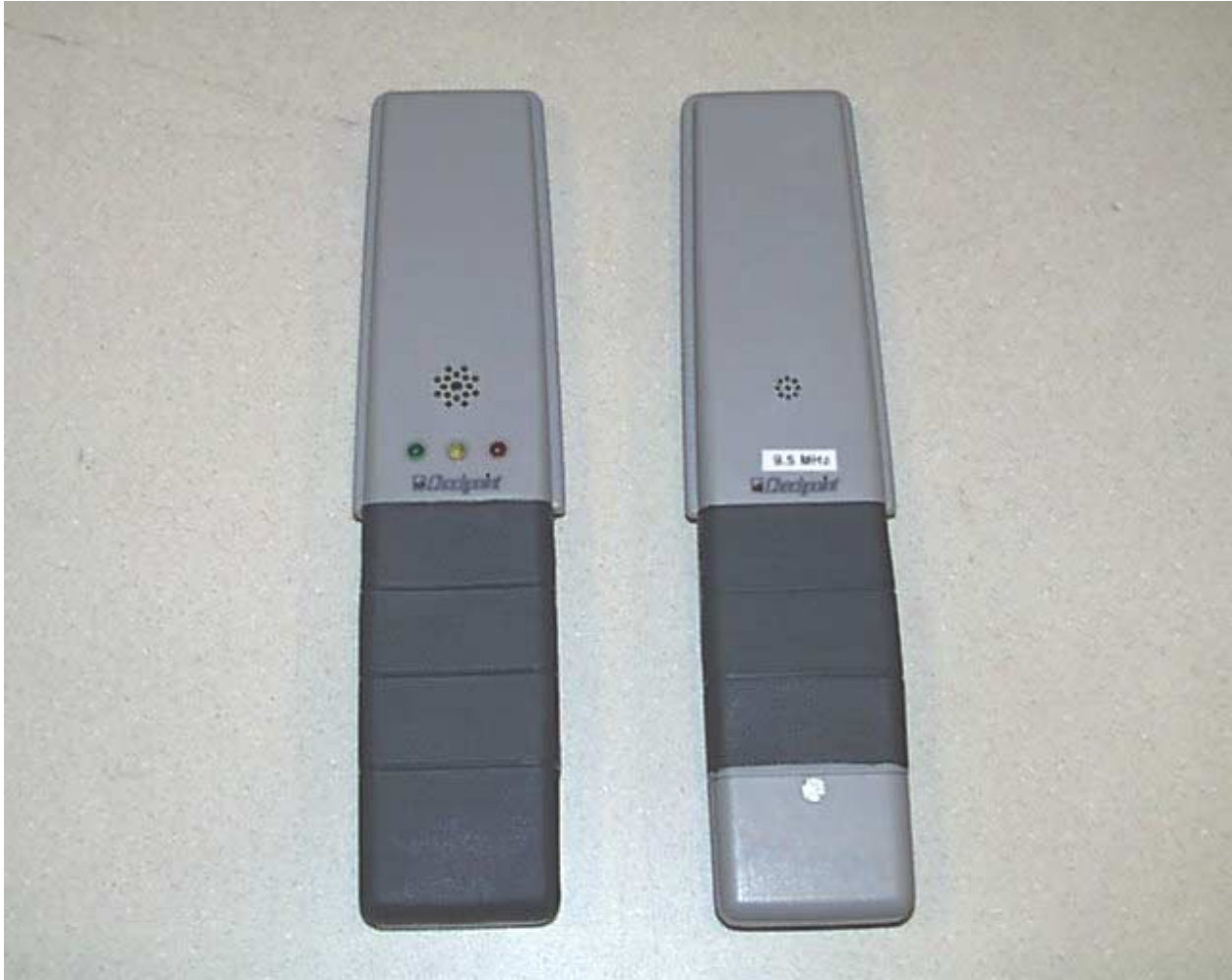
Photo 1 – View of Both Front (left) and Back (right) Halves of Enclosure