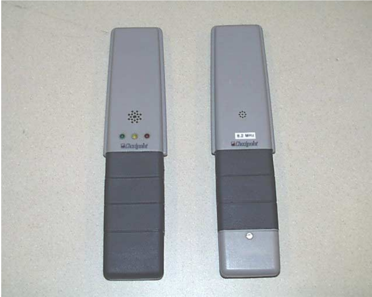
Photo 1 – View of Both Front (left) and Back (right) Halves of Enclosure