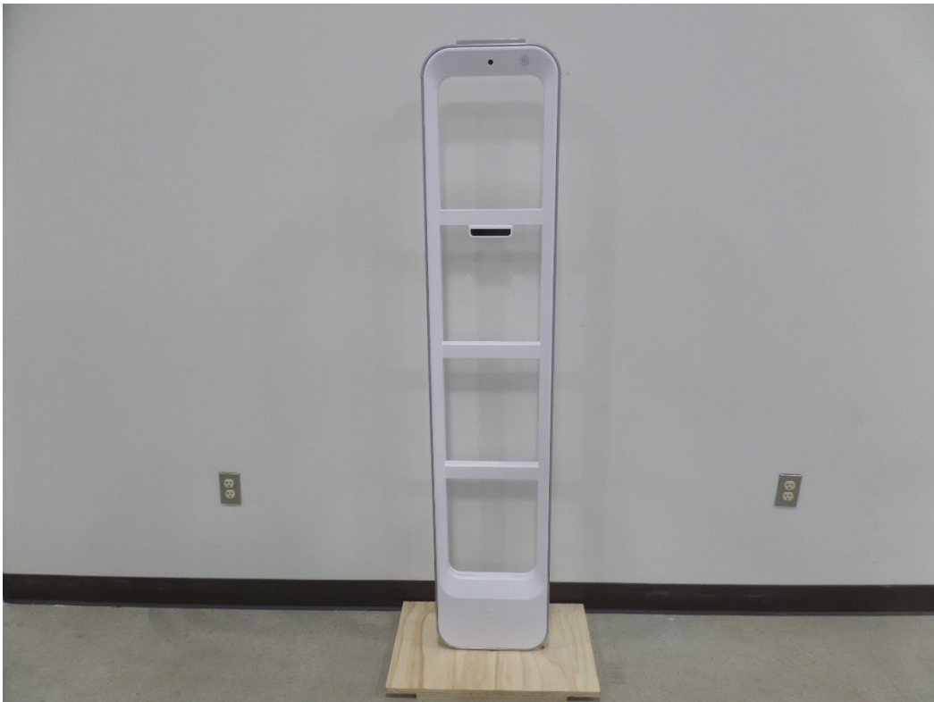
Figure 4: NP22 SAB BACK SIDE