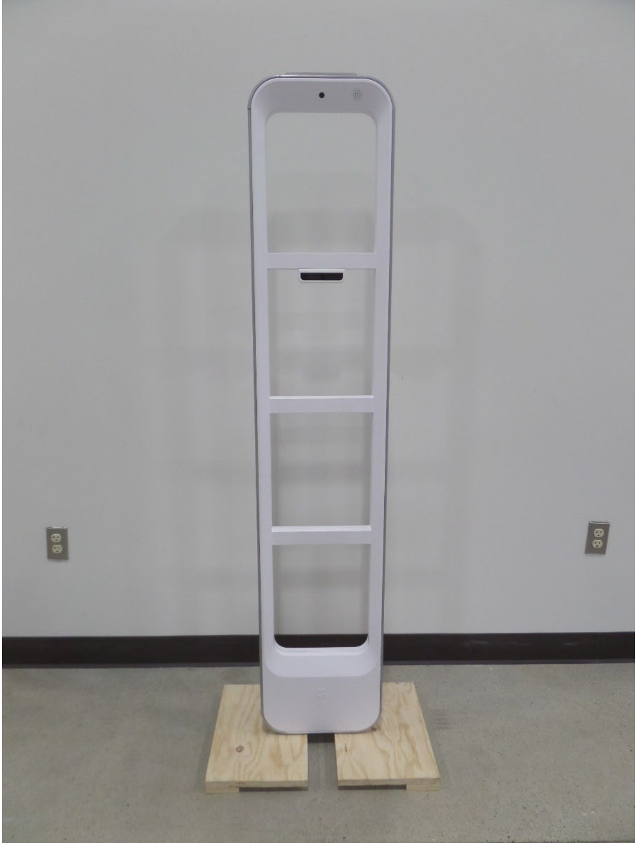
Figure 1: NP22 PRI/PAB FRONT SIDE