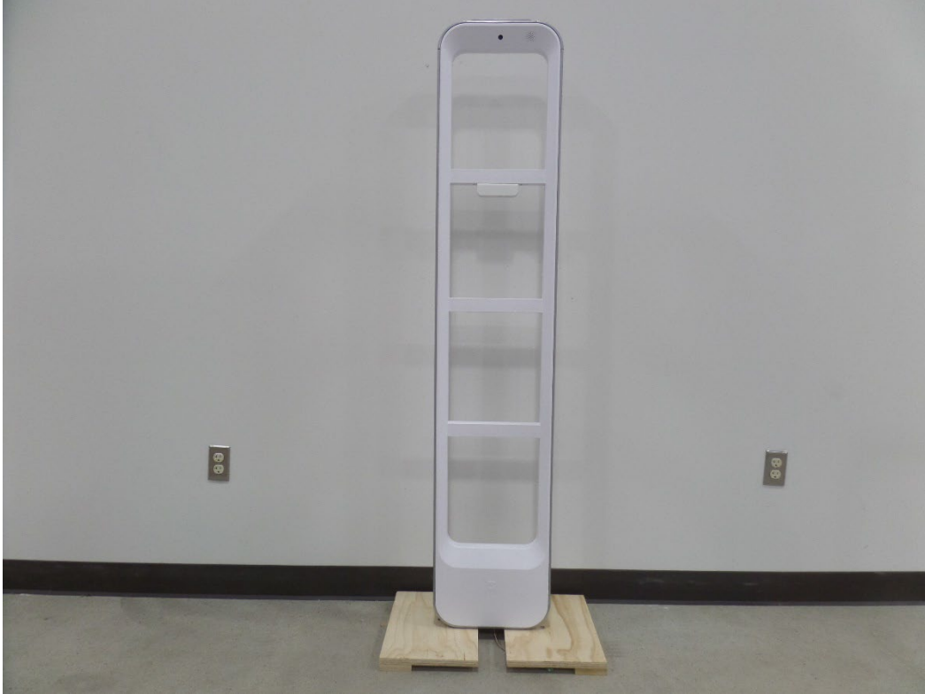
Figure 3: NP22 SAB FRONT SIDE