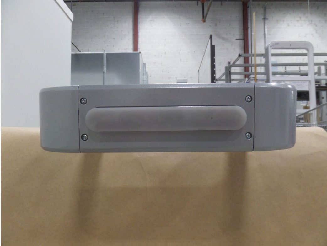
Figure 7: NP22 PRI/PAB TOP SIDE