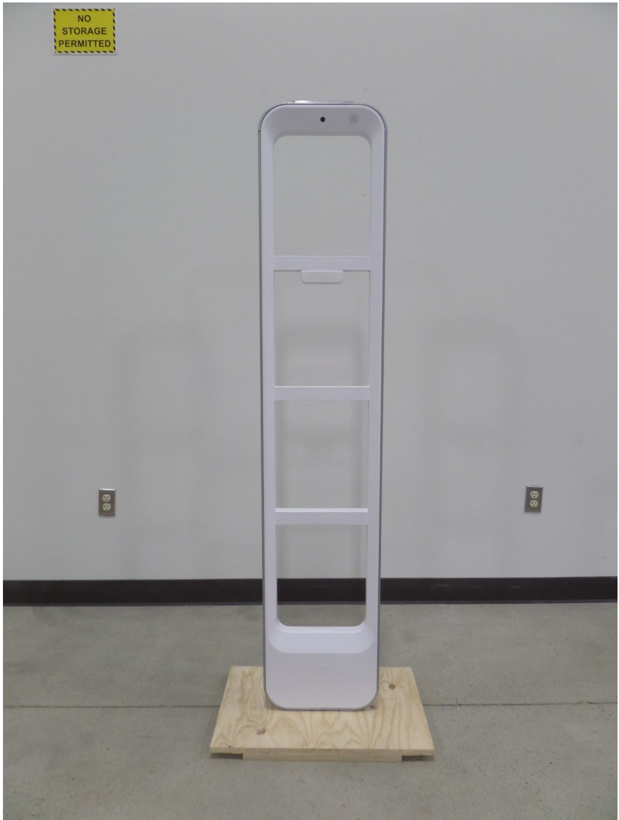
Figure 2: NP22 PRI/PAB BACK SIDE