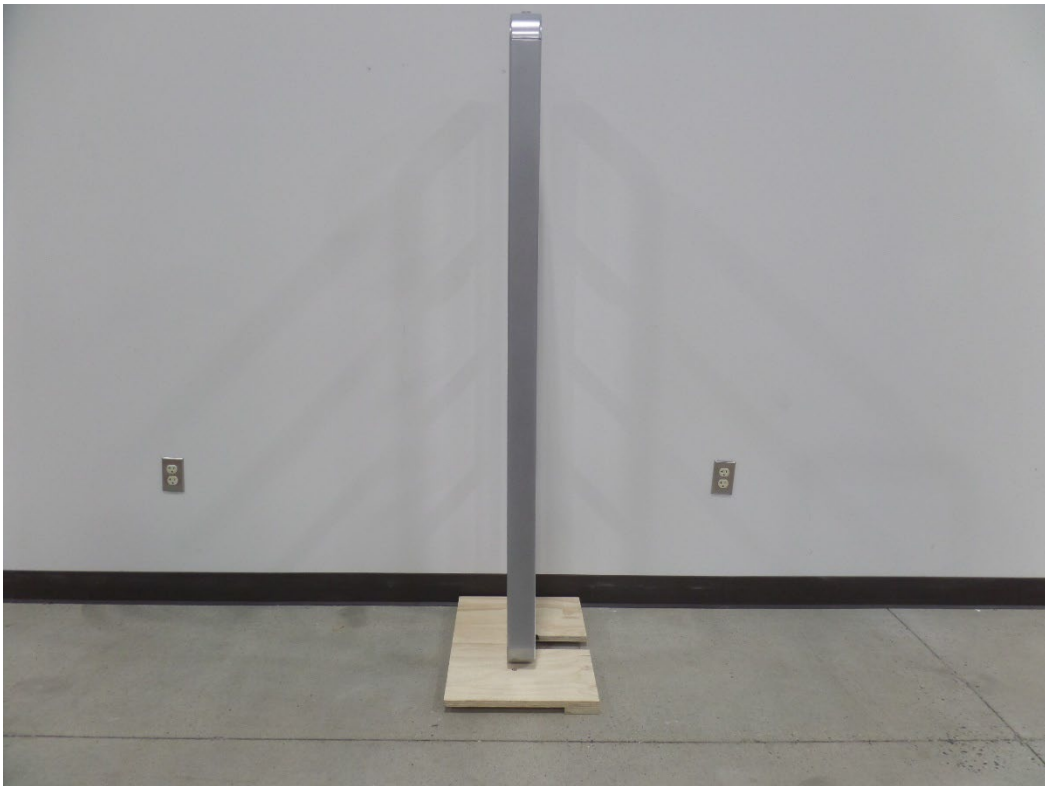
Figure 6: NP22 PRI/PAB, NP22 SAB RIGHT SIDE