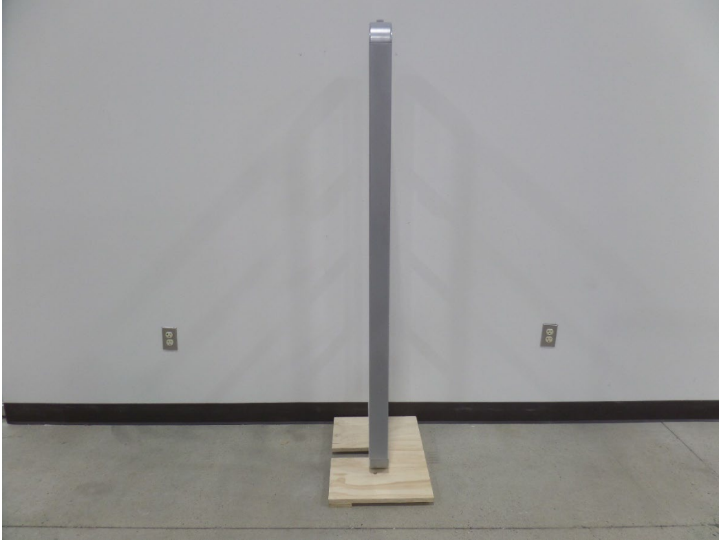
Figure 5: NP22 PRI/PAB, NP22 SAB LEFT SIDE