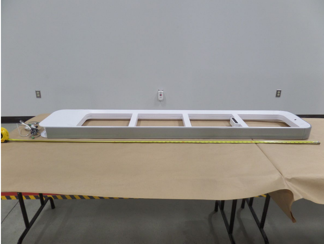
Figure 9: NP22 PRI/PAB/SAB RF ANT FRAME