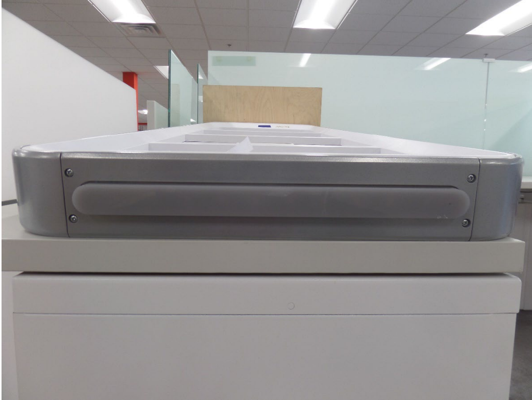
Figure 5: NP12 PRI/PAB, NP12 SAB TOP SIDE