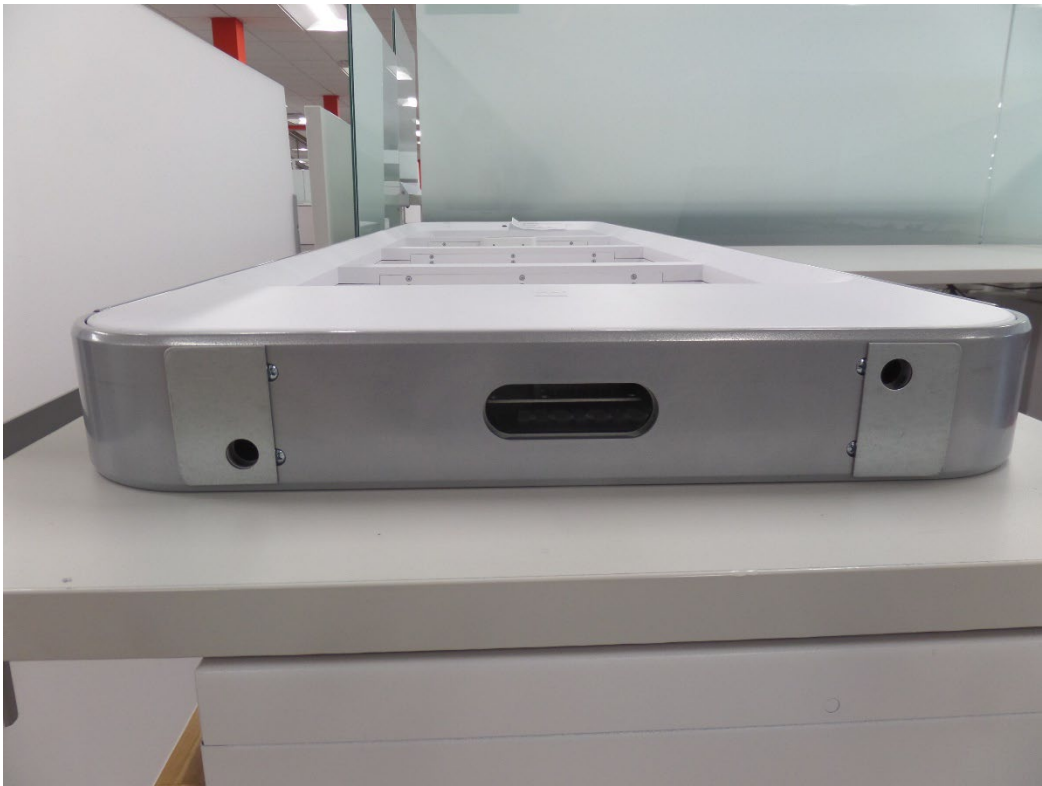
Figure 6: NP12 PRI/PAB, NP12 SAB BOTTOM SIDE