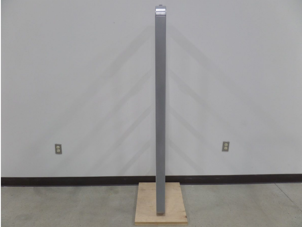
Figure 3: NP12 PRI/PAB, NP12 SAB LEFT SIDE