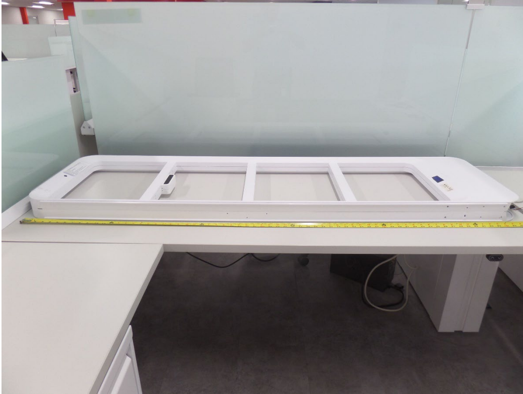
Figure 7: NP12 PRI/PAB/SAB RF ANT FRAME