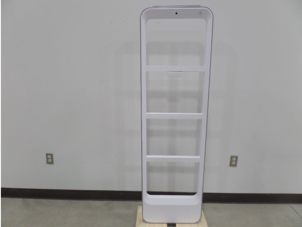
Figure 1: NP12 SAB FRONT SIDE