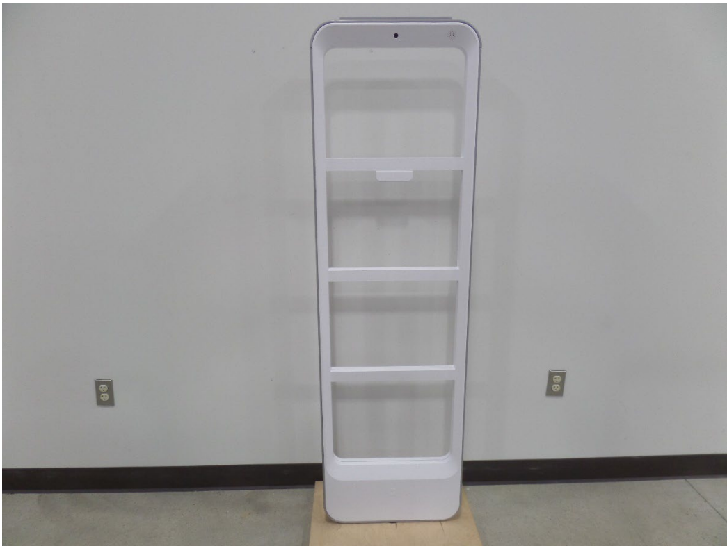
Figure 2: NP12 PRI/PAB BACK SIDE