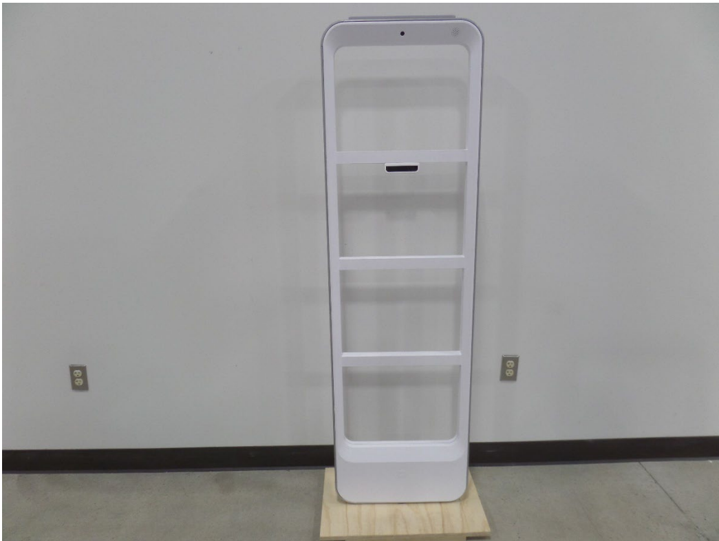
Figure 2: NP12 SAB BACK SIDE