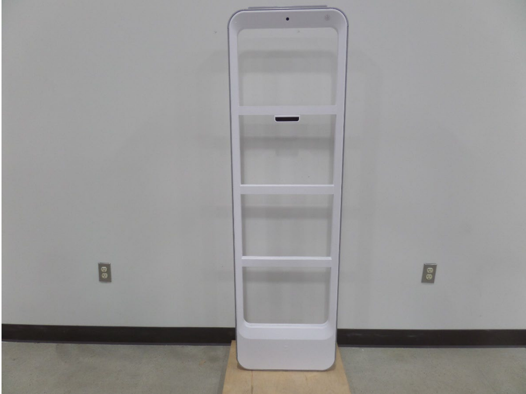
Figure 1: NP12 PRI/PAB FRONT SIDE