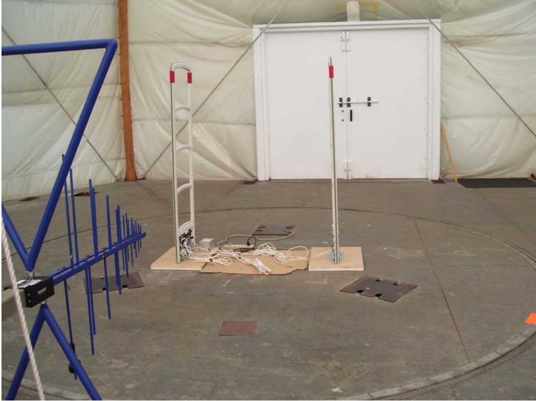
Figure 2 – Final Radiated Emissions at OATS site