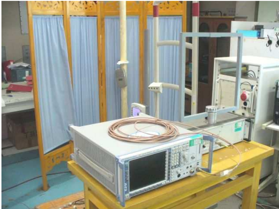
Photograph 4: Set-up for emission bandwidth & duty cycle