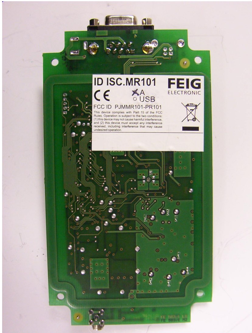
Transmitter PCB bottom