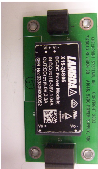
DC Power Module PCB top