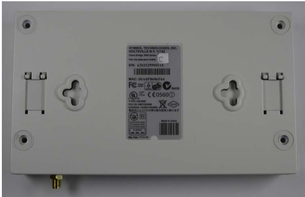
Assembly PCB / Antenna