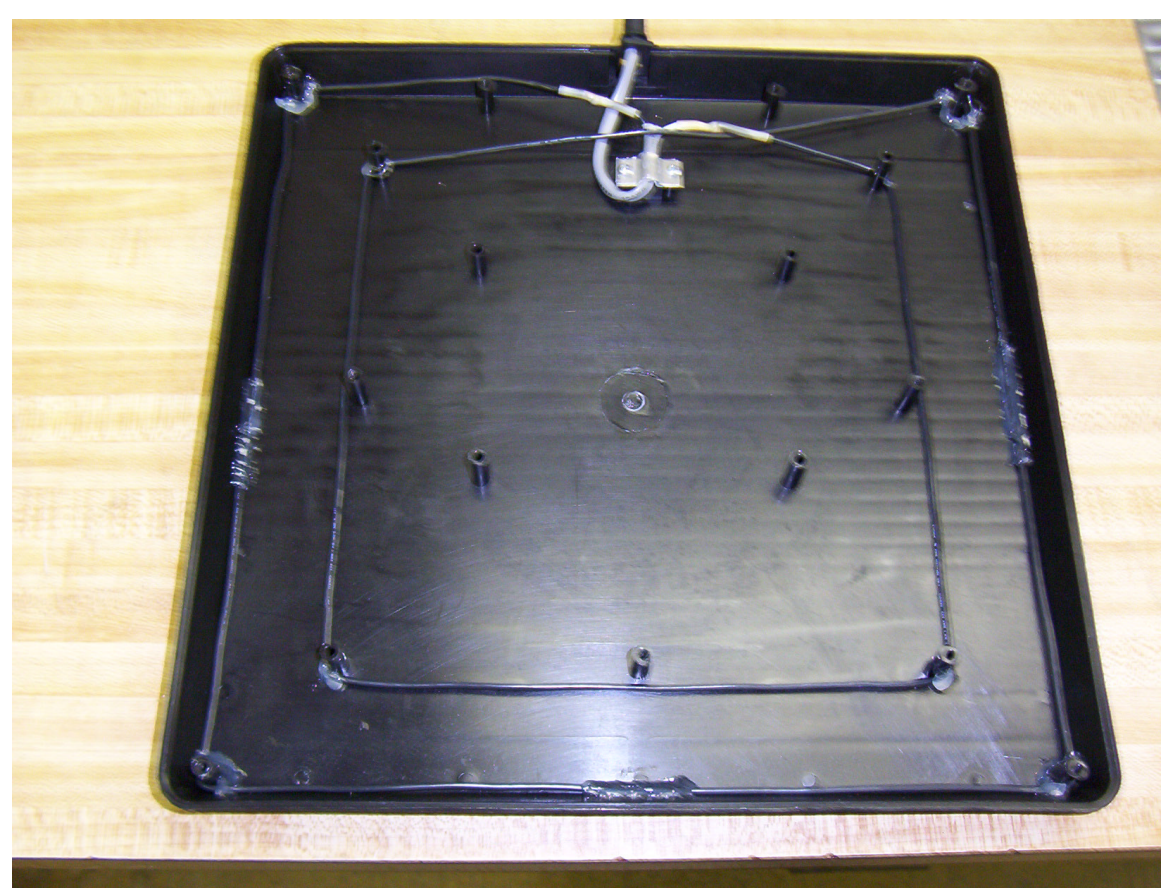
Checkpoint Systems, Inc.: Internal Photo of CP9-2 Antenna