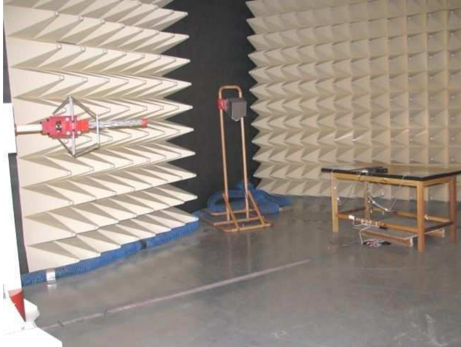
Photograph 5: Set-up for radiated emission (30 - 1000MHz)