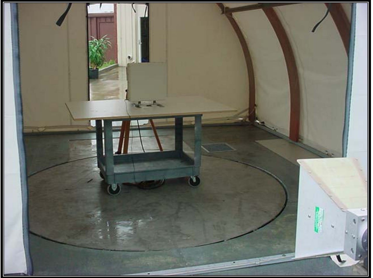
Figure F-1: Radiated Spurious Emissions – Front View