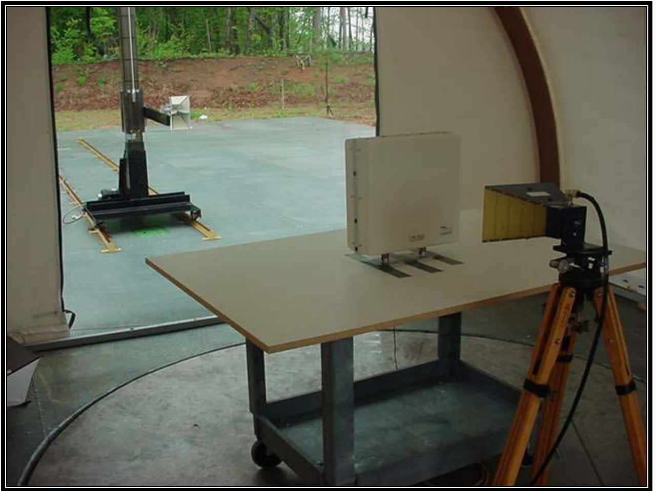
Figure F-2: Radiated Spurious Emissions – Rear View