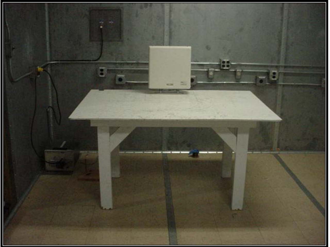
Figure F-3: Conducted Emissions