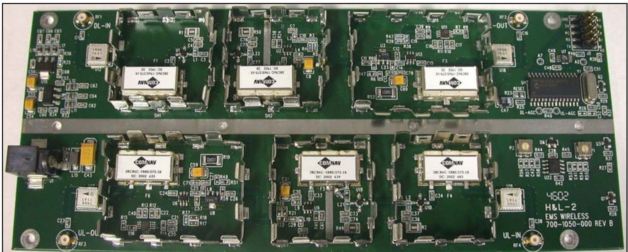
Figure 2: Internal – PCB Top View