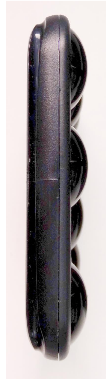
End External Views ( Right )