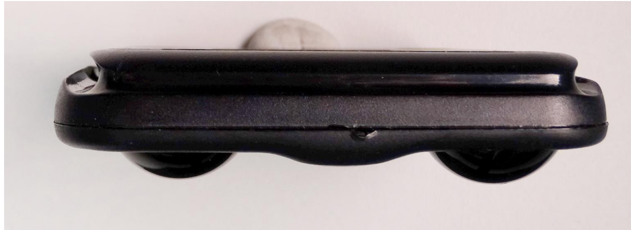
End External Views ( Rear )