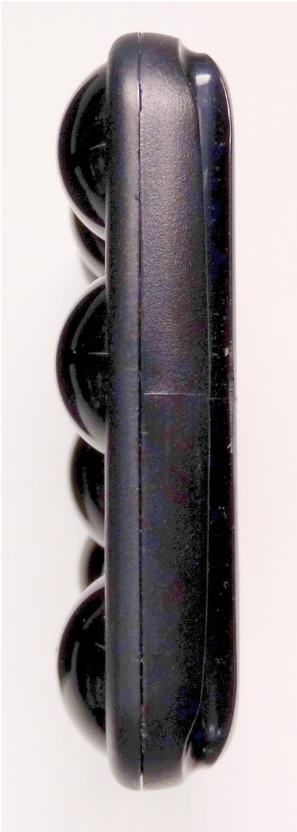
End External Views ( Left )