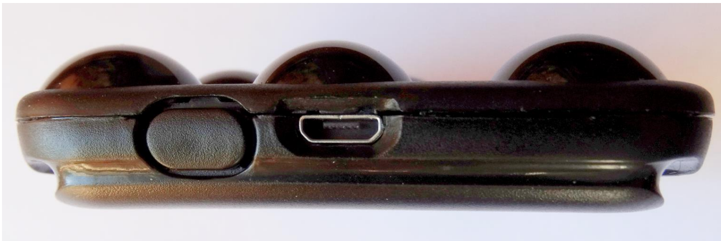
End External Views ( On/Off Switch USB Port)