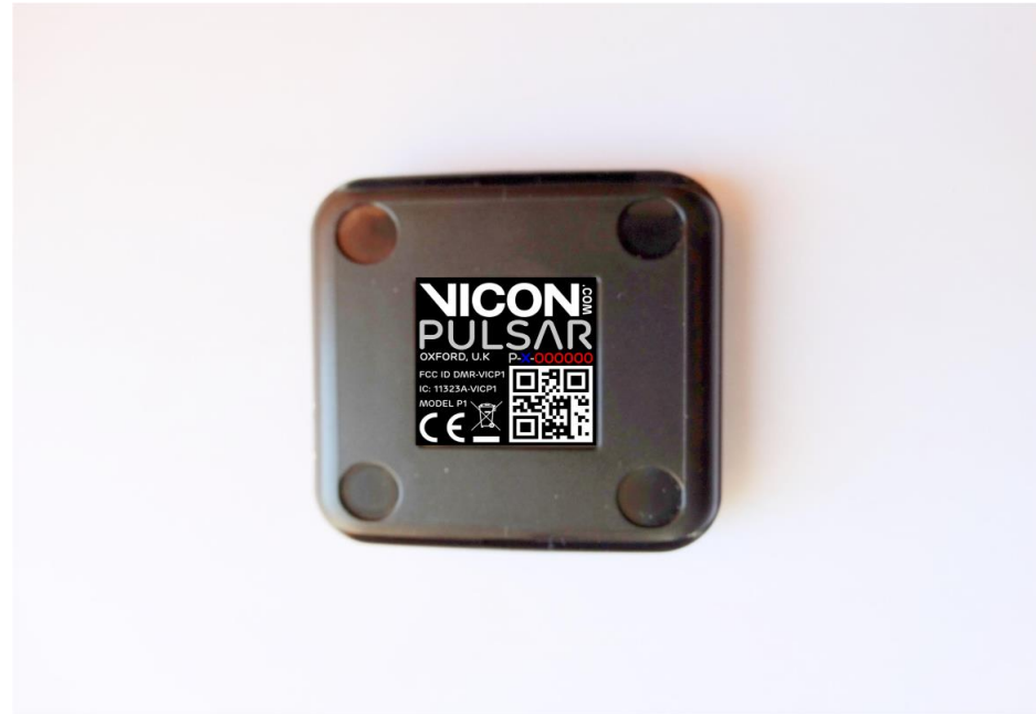
Top and Bottom External Views ( Simulated Label)