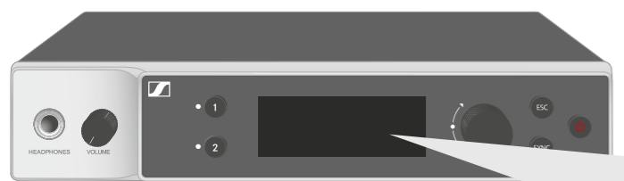
System Home Screen