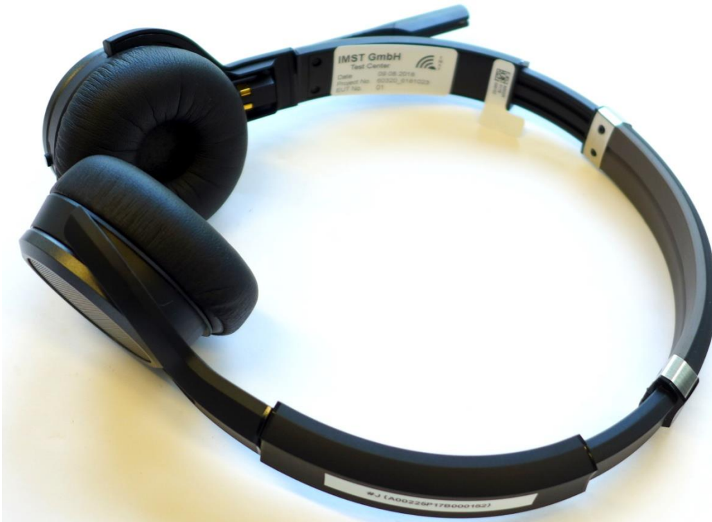
Pic. 1: Outer side view of the device under test.