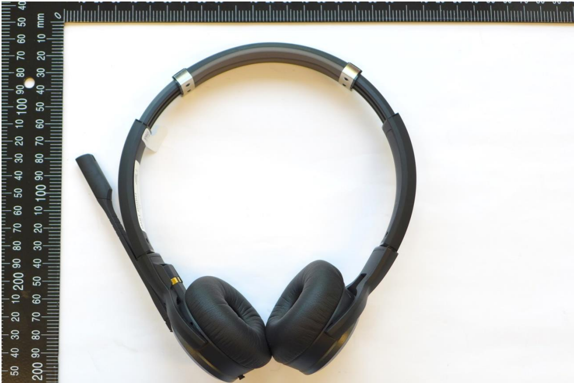
Pic. 2: Side view of the device under test.