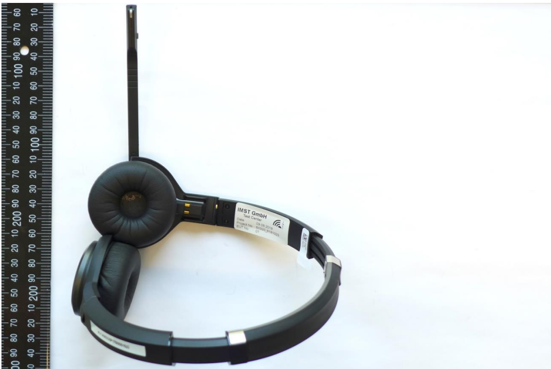
Pic. 3: Inner side view of the device under test with turned microphone handle at 90°