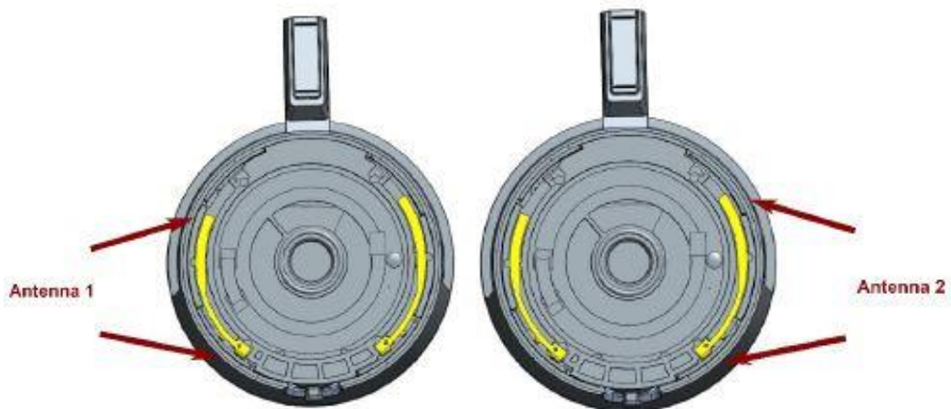
Fig. 1: Sketches and antenna locations of the EUT (marked in yellow).