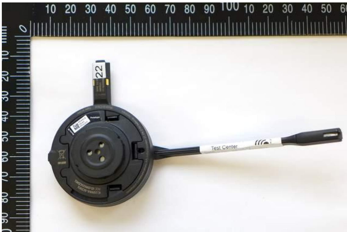
Pic. 2: Back and left side view of the device under test.