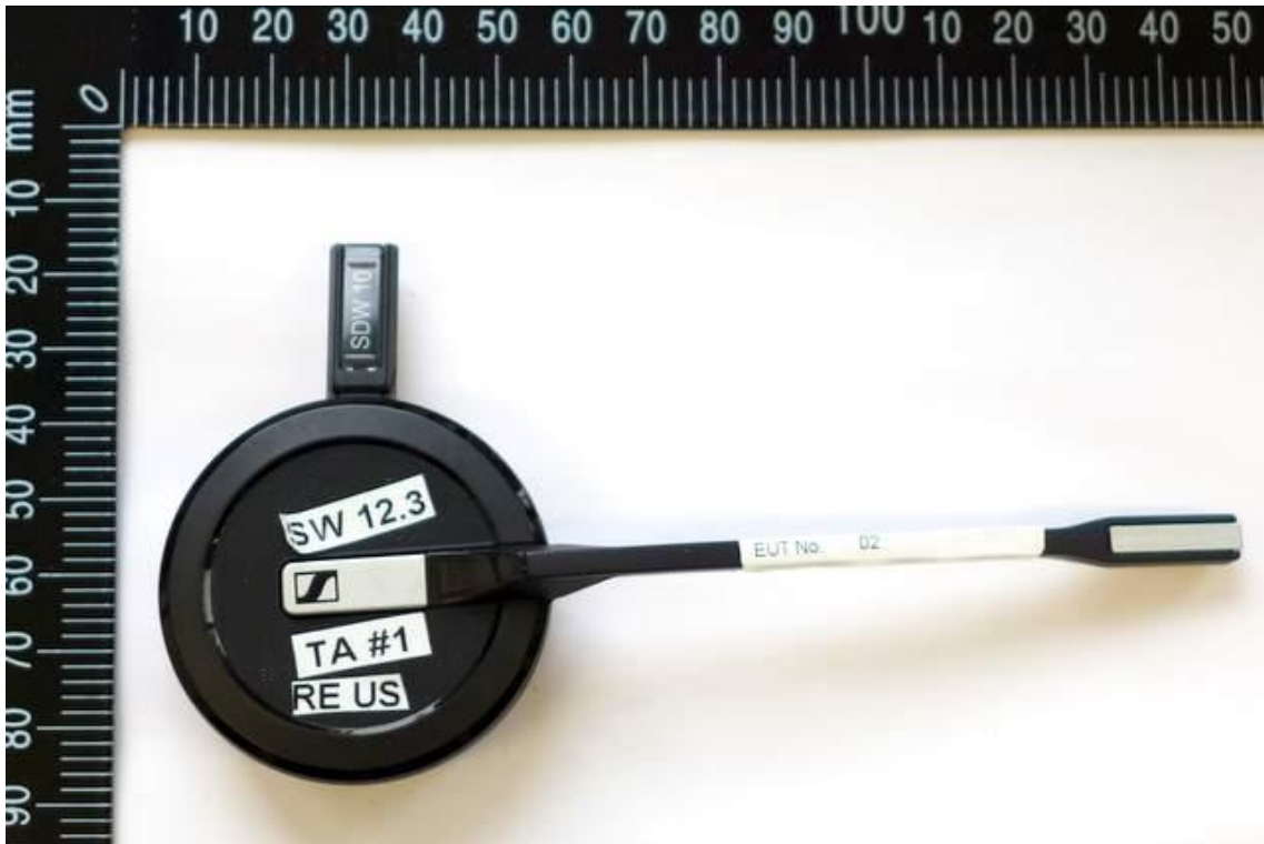
Pic. 1: Front and right side view of the device under test.