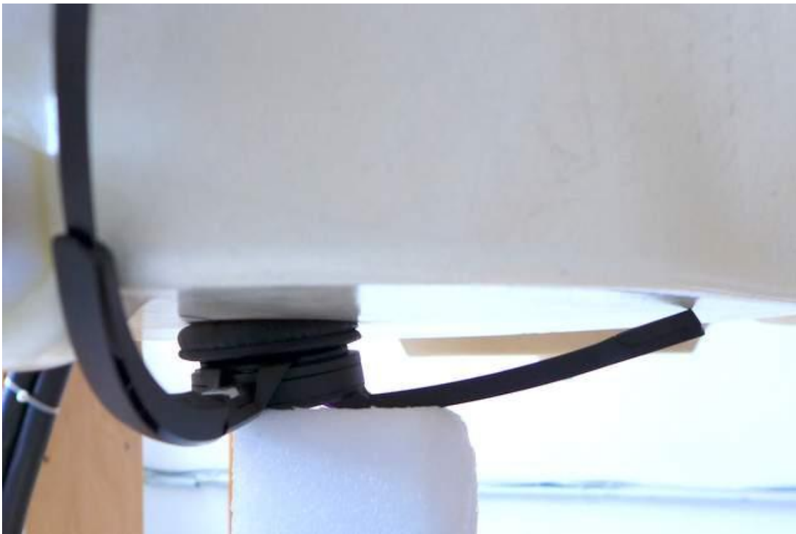
Pic. 4: Test position – inner side with attached metal head band, 0mm distance to phantom.