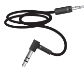
Audio cable with 2.5-mm and 3.5-mm jack