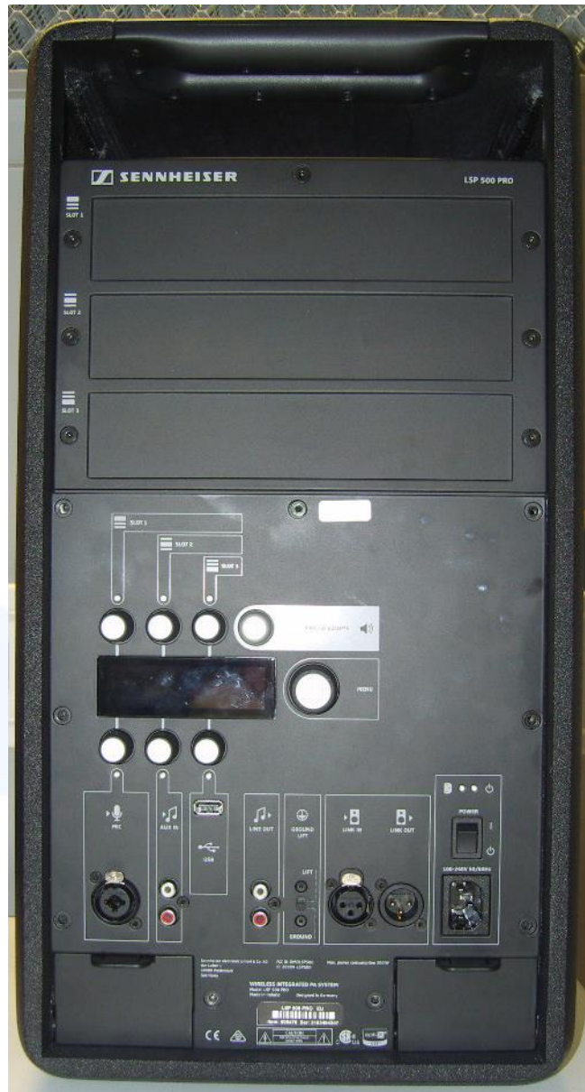
New design of the rear plate.