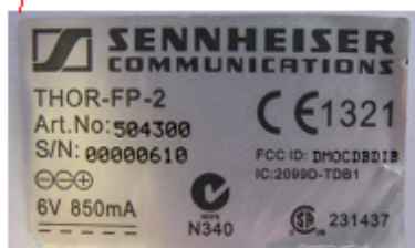
Figure: 1.2 Label 1