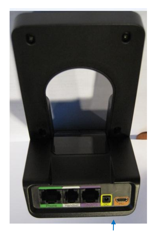
Figure 1.1: SD BS-US (view from back )