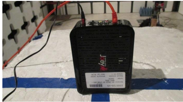
Z-AXIS FRONT PHOTO