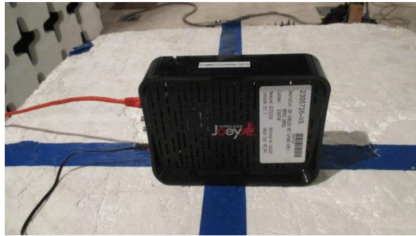
Y-AXIS FRONT PHOTO