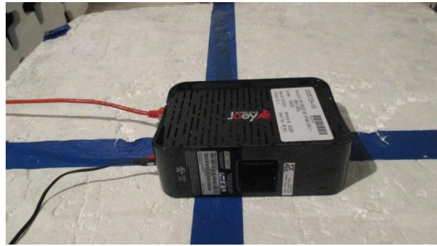
X-AXIS FRONT PHOTO