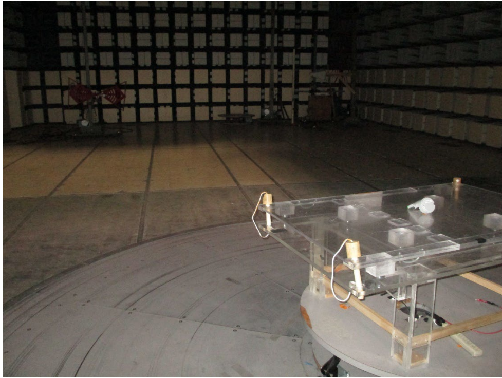
Radiated Emissions, 30 MHz to 1 GHz