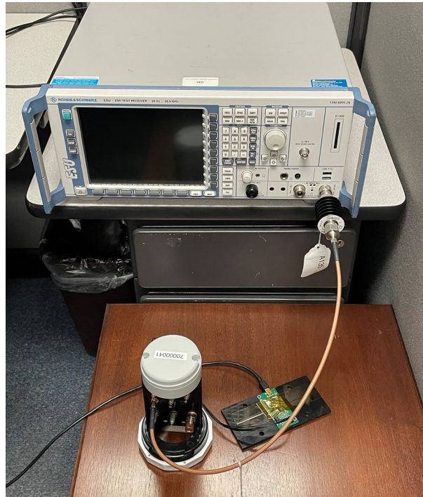
Power, Bandwidth, PSD