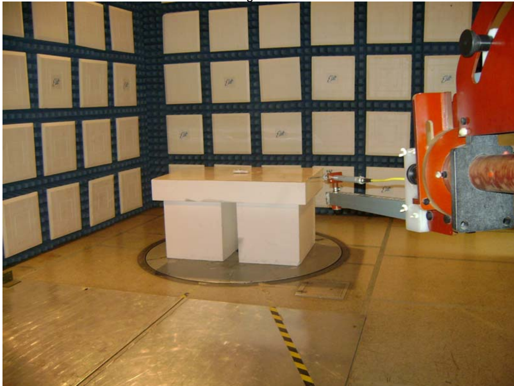
Test Setup for Radiated Emissions – 908MHz - Horizontal Polarization - Transmitter