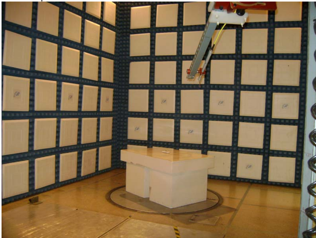
Test Setup for Radiated Emissions – 908MHz – Vertical Polarization - Transmitter