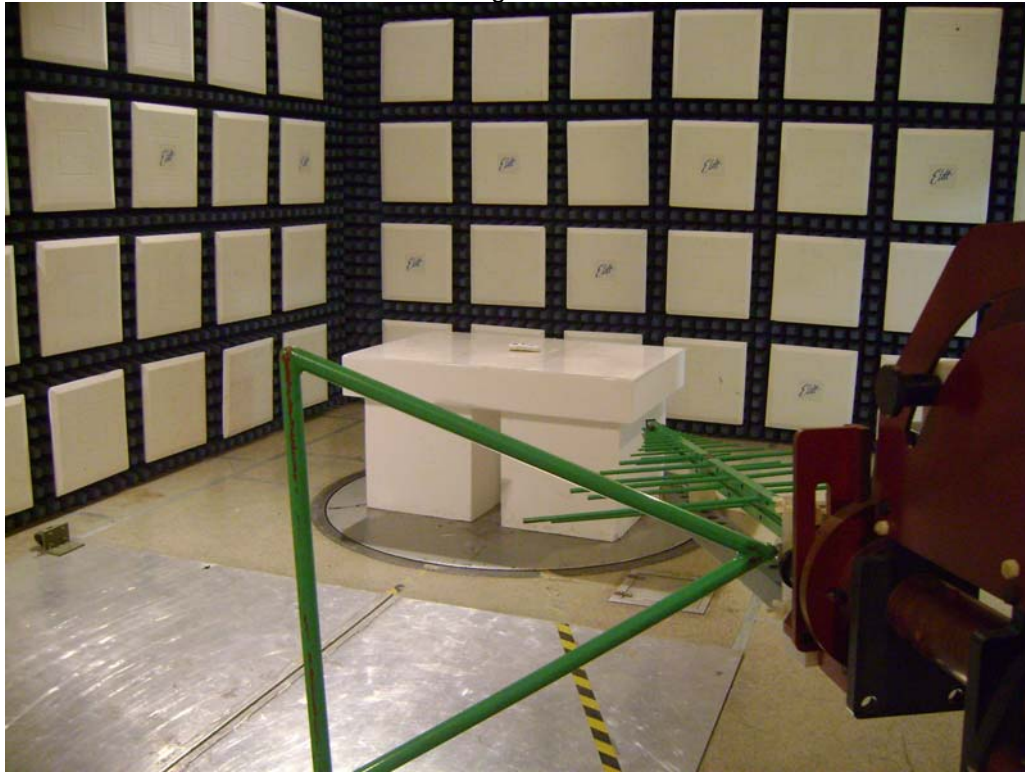
Test Setup for Radiated Emissions – 30MHz to 1GHz – Horizontal Polarization