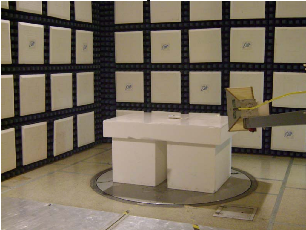
Test Setup for Radiated Emissions, 1GHz to 10GHz – Horizontal Polarization