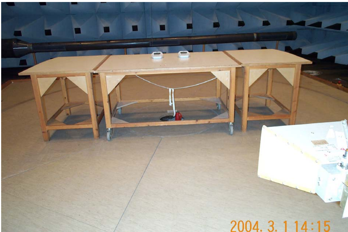
Photo 2 Set-up for measurements 1 - 10 GHz.