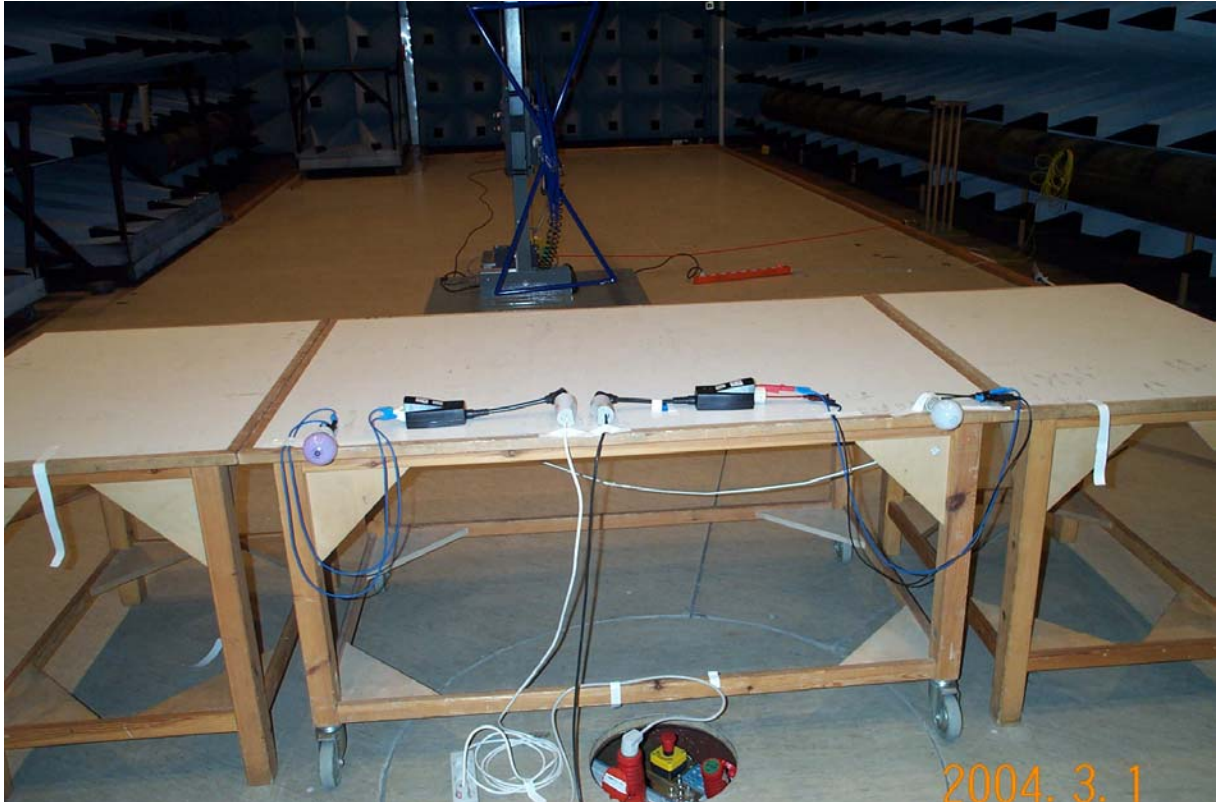
Photo 3 Set-up for measurements 30 – 1000 MHz. Date is 2004-02-12 Camera wrongly set.