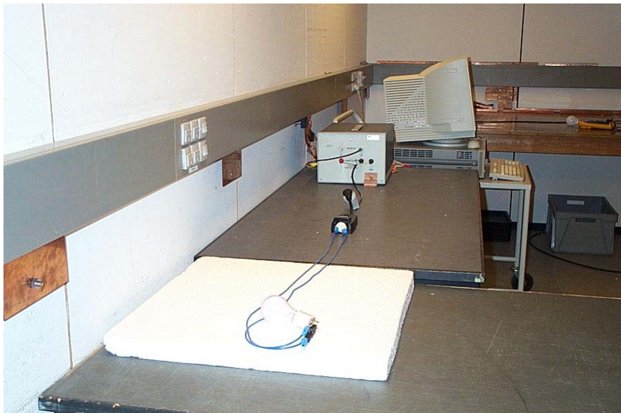
Photo 2 Set-up for conducted emission. Measurements performed in screened room. LISN bonded to vertical ground plane (wall).