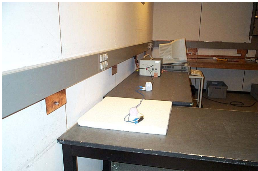
Photo 1 Set-up for conducted emission measurements. The LISN is bonded to the vertical ground plane (wall) of the screened room.