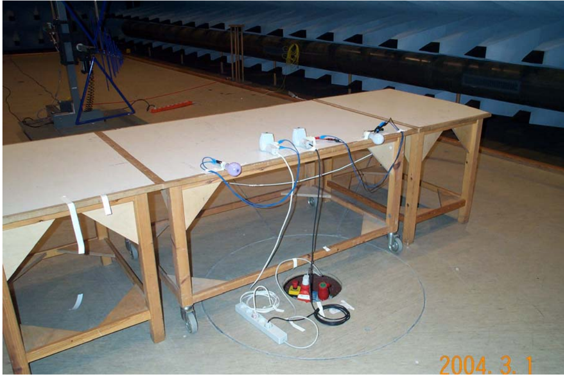
Photo 3 Set-up for measurements 30 – 1000 MHz. Date is 2004-02-12. Camera time is faulty.