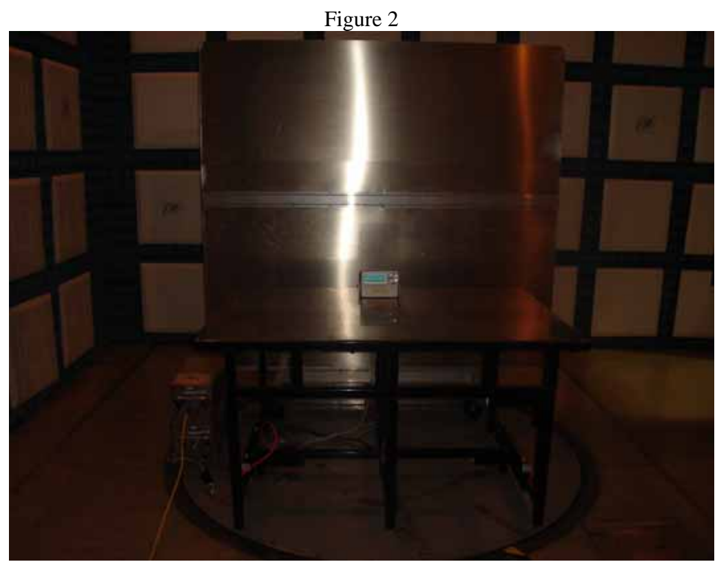
Test Setup for Conducted Emissions