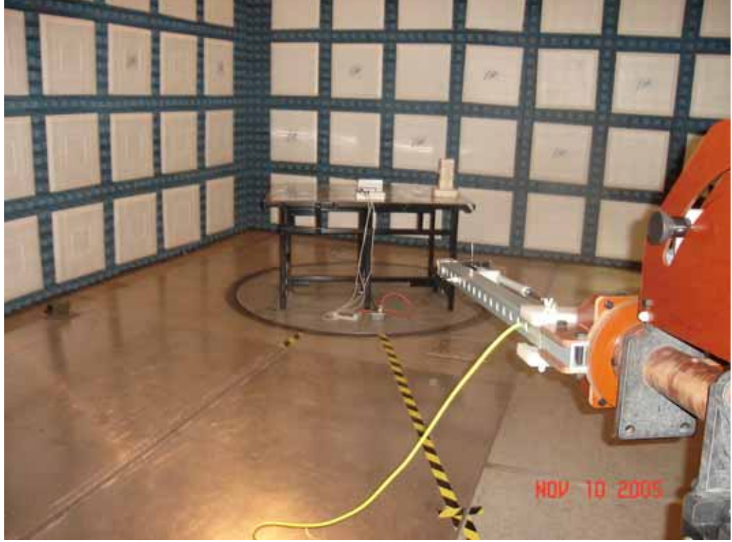
Test Setup for Radiated Emissions, 30MHz to 1GHz - Vertical Polarization