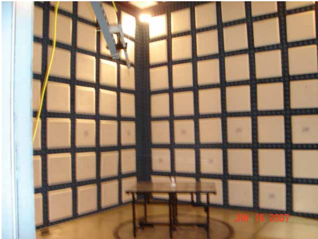
Test Set-up for Radiated Emissions 908.4MHz – Vertical Polarization