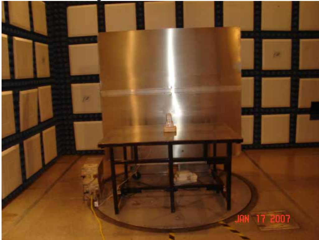
Test Set-up for Conducted Emissions