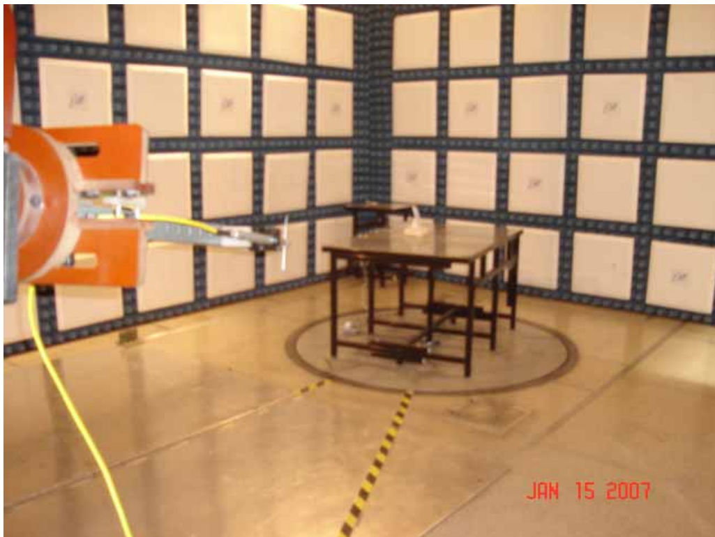
Test Set-up for Radiated Emissions, 908.4MHz – Vertical Polarization