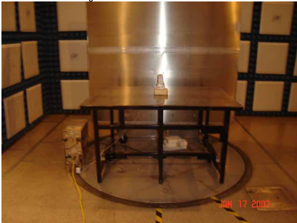
Test Set-up for Conducted Emissions