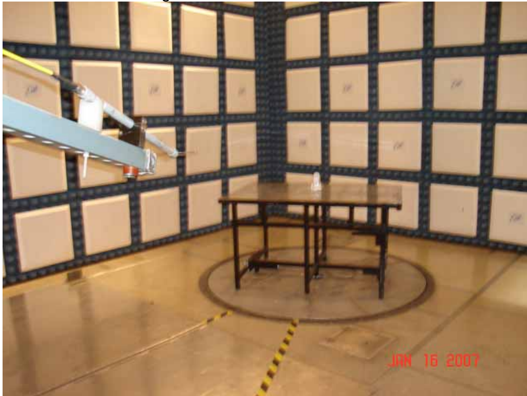
Test Set-up for Radiated Emissions 908.4MHz – Horizontal Polarization