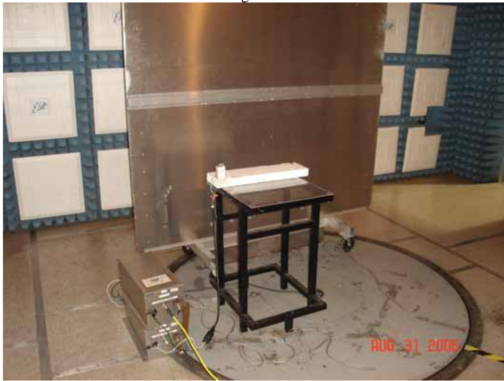
Test Setup for Conducted Emissions