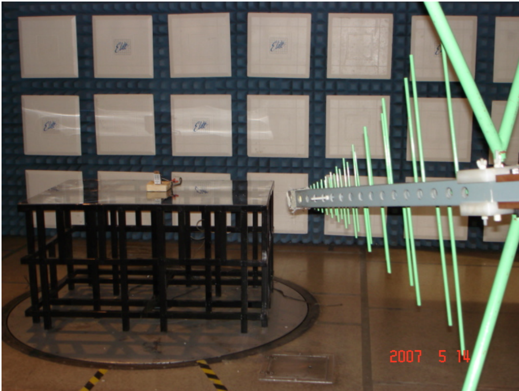
Test Set-up for Radiated Emissions – 30MHz to 1GHz - Vertical Polarization - Receiver