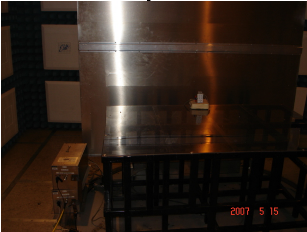
Test Set-up for Conducted Emissions